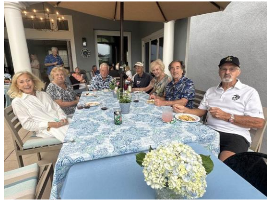
It was musical chairs all day . . . talking, laughing, moving about . . . enjoying the festivities!